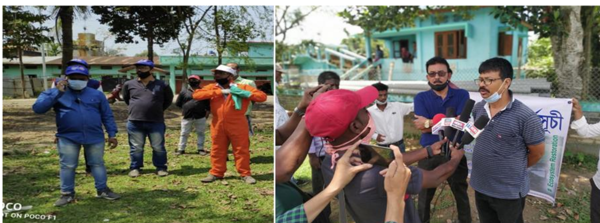
Fig: Sanitisation programme on 28.07.20