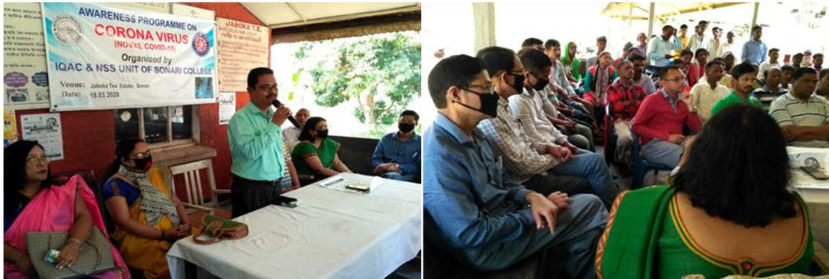
Fig: Awareness Programme at Joboka Tea Estate on Corona Virus on 18.03.20