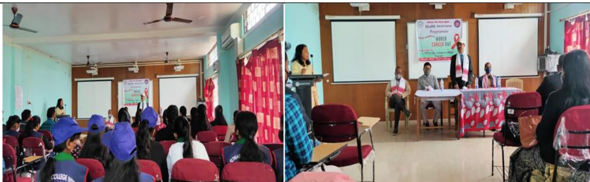
Fig: Cancer Awareness Programme on world cancer day on 04.02.22

Principal Principal SONARI COLLEGE SONARI