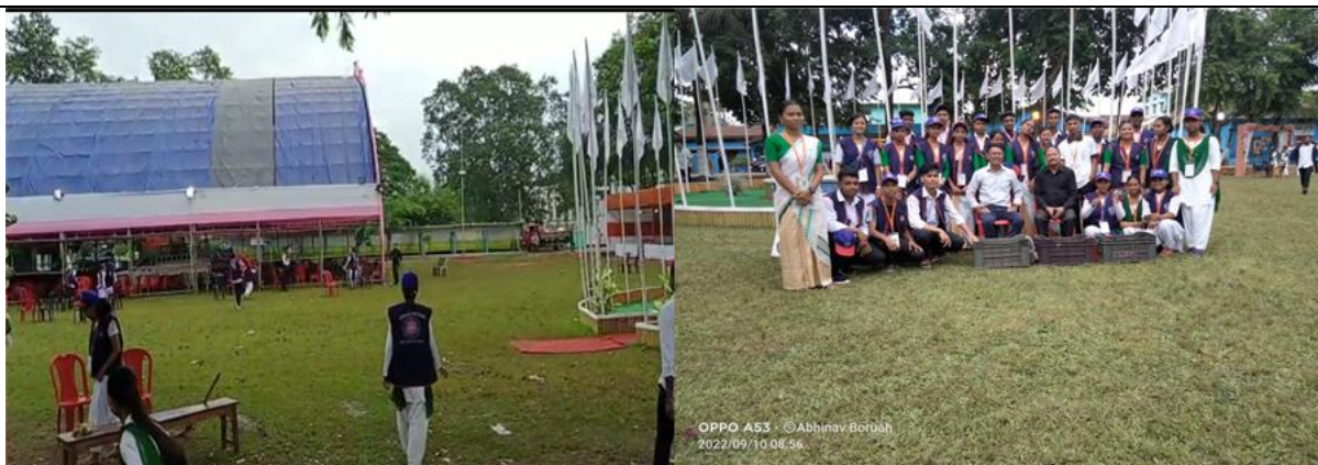
Fig: A Cleanliness drive in the college premises as well as in the public field of Sonari on 10.09.22