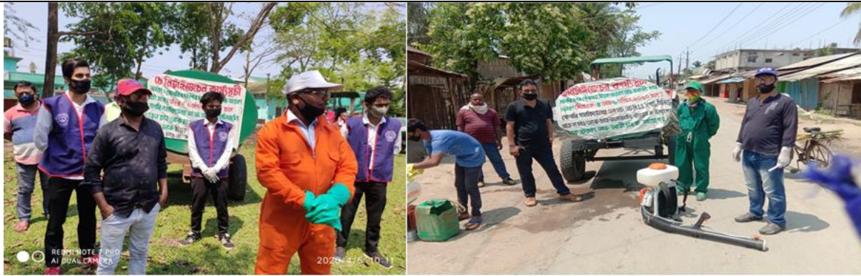
Fig: Two Days Sanitisation Programme at Teok TE, Joboka TE & Borahi TE on 05.04.20 & 06.04.20