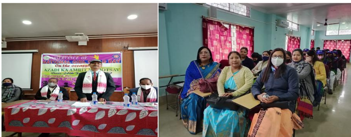
Fig: Observance of International Girl Child Day to create awareness about the importance of Girl Child on 24.01.22