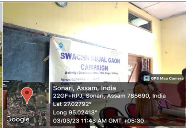
Fig: A cleanliness drive and slogan writing competition organised by district administration, Charaideo under Swachha Sujal Gaon Campaign on 03.03.23