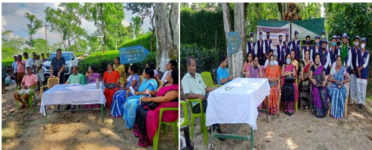
Fig: An awareness programme on evils of child marriage, women trafficking and proper use of social media on 23.09.21

Principal Principal SONARI COLLEGE SONARI