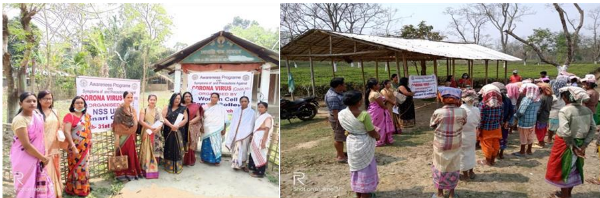
Fig: Awareness programme at Sonalipam on Corona virus on 17.03.20