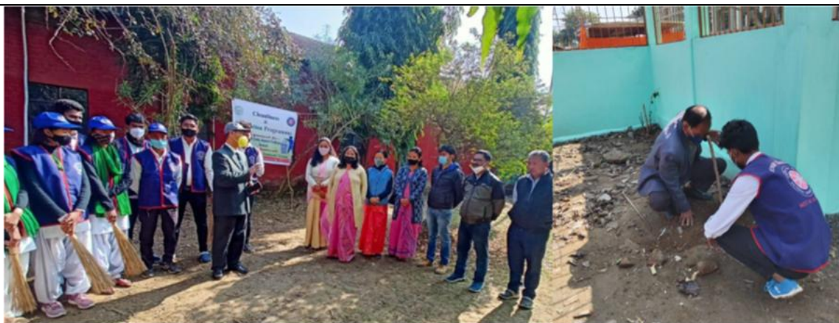
Fig: Cleanliness and Plantation Drive on 29.01.22