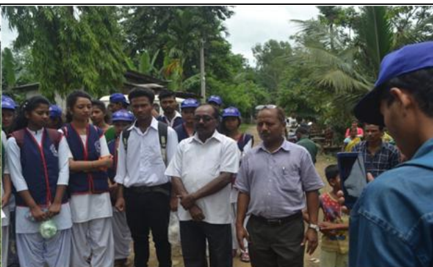
Fig: Summer camp (100 hours at adopted villages) from 03.07.18 to 11.07.18

[Signature] Principal SONARI COLLEGE SONARI