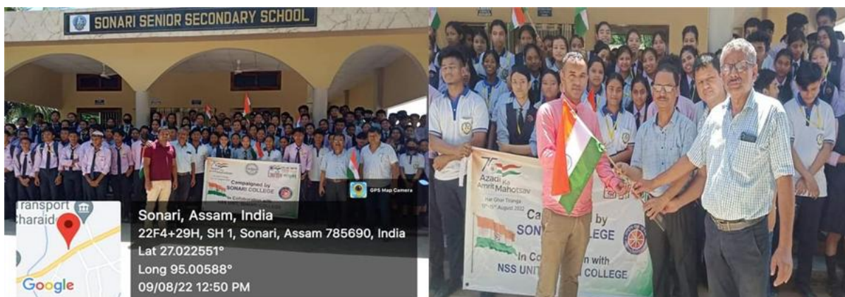
Fig: NSS Unit Sonari College participated Har Ghar Tiranga campaign in different educational institutions and villages in Charaideo district on 09.08.22