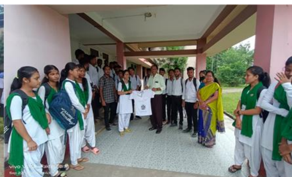
Fig: Swachhata Bharat Mission Programme organised by Sonari Municipal Board Under Ministry of Housing and Urban Affairs on 23.09.22