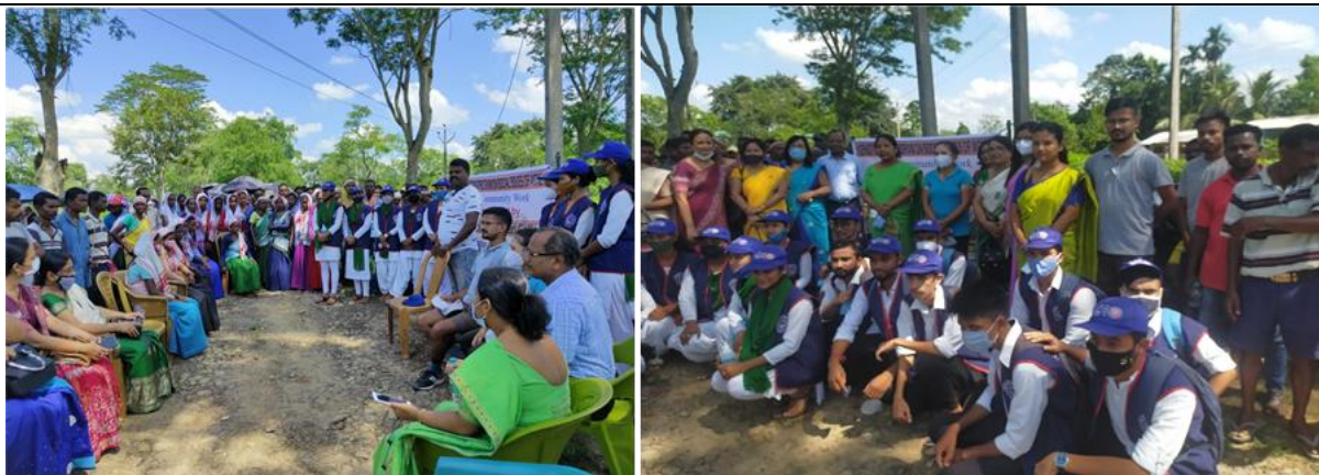
Fig: A Sensitisation Programme at Joboka Tea Estate on 20.09.21