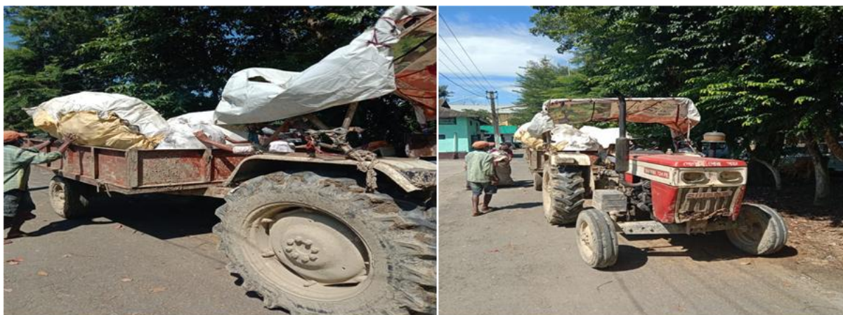
Fig: Cleanliness Drive in the College premises on 26.07.20

[Signature] Principal SONARI COLLEGE SONARI